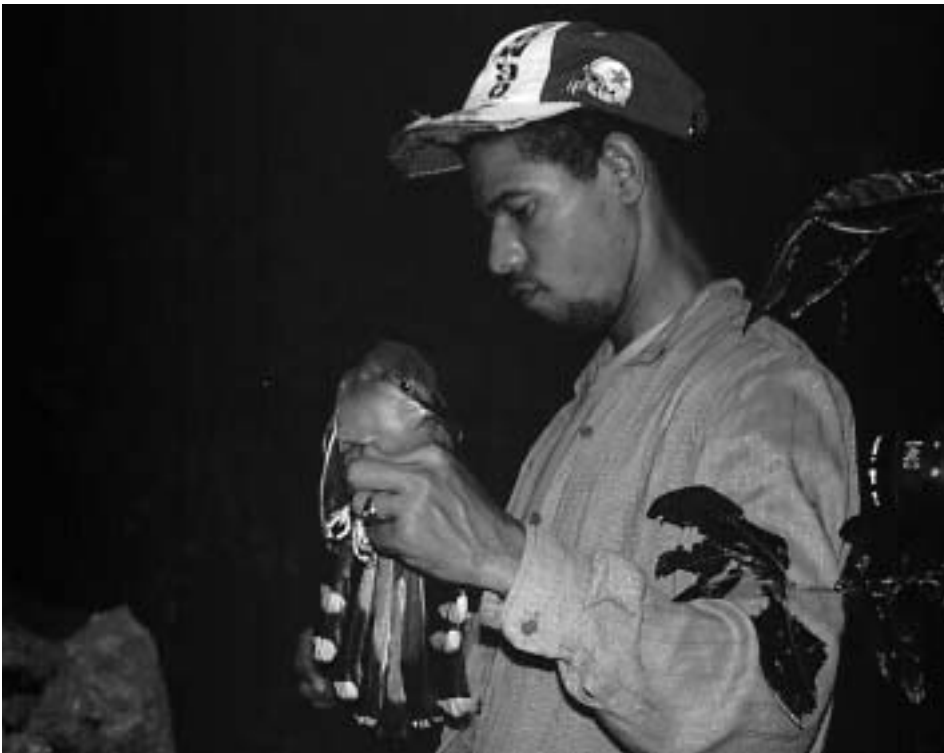
Figure 2. Research assistant with resident bird.

the pine forests only during the winter months. Migratory birds fly from the colder north to spend the winter in the tropics, where it is warm. The scientists in this study wanted to learn what kind of food the resident birds and migratory birds eat during the winter months.