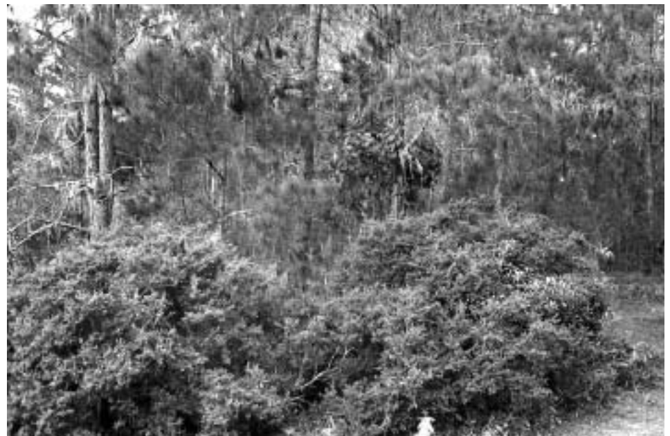
Figure 3. Forest with understory and broadleaf/pine overlap.

Seventy-eight percent of the birds foraged in an area between 5 and 10 meters from the ground (How many yards is this? See the “Methods” section above to find out how to calculate this). This is the height where the pine needles and the broad leaves overlap. Below 5 meters high and closer to the ground, the plants are mostly broad leafed. Above 10 meters, the plants are mostly pine trees. Most of the birds they observed in the Caribbean pine forests were