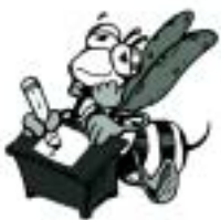
Table 2. Example of how the scientists summarized their observations.