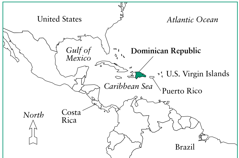
Figure 1. Location of the Dominican Republic in the Caribbean Sea.

Even the same kind of animals might eat different kinds of foods. Over hundreds or thousands of years, animals have adapted to different environments where food is available. In this study, the scientists wanted to study the diets of birds. For example, some birds eat insects, some eat berries, some eat nectar (the sweet liquid from a plant), and some eat seeds. Some birds eat more than one type of food. When different